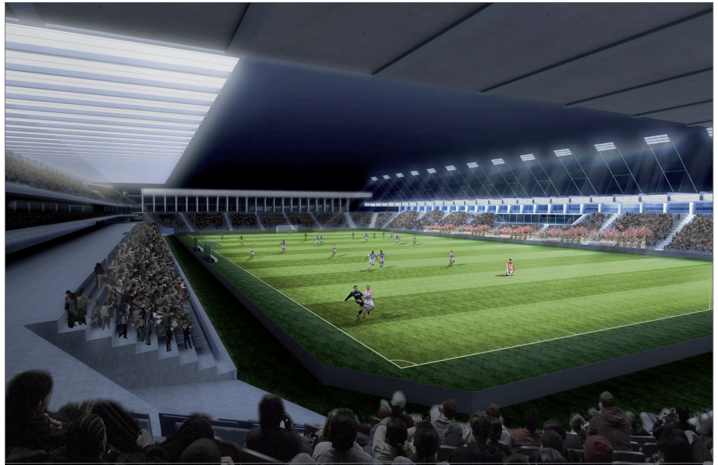
View of Soccer Field, Cracovia Soccer Stadium, Krakow, Poland

With Autodesk BIM software, SENER Engineering Group gains a competitive advantage and positions itself for the future.