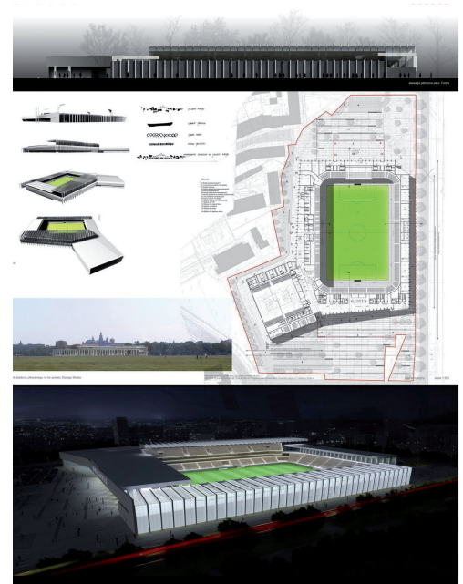
Various Views, Cracovia Soccer Stadium